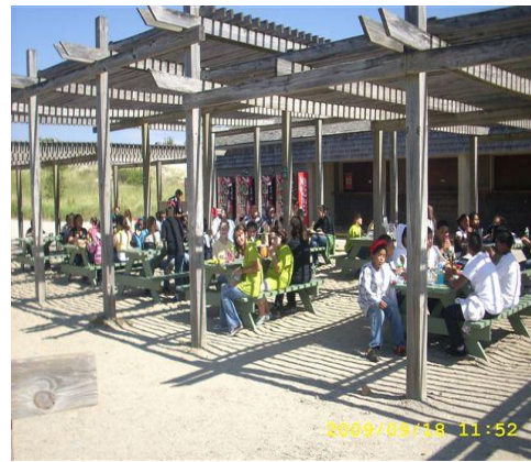
6th Graders break for lunch at Crane's Beach

The Second Form (Grades 7 and 8) climbed Mt. Wachusett, a 2,000 foot mountain in Princeton MA. And the First Form (Grade 6) enjoyed a day apple picking at Russell Orchard and then hiked through the dunes at Crane's Beach in Ipswich, MA.