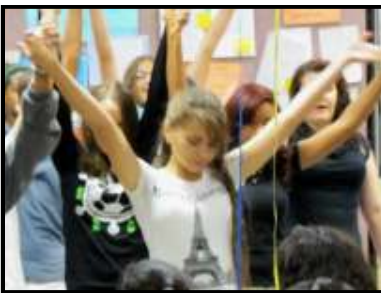
Above: 'We Too Sing America'

the school and ended the night dancing to traditional music of the Hispanic culture.