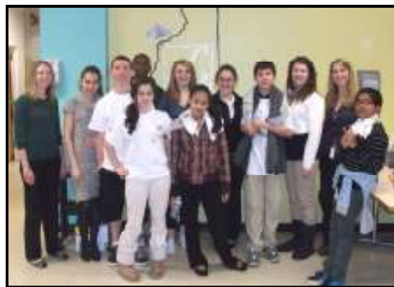
Lower School Allies in Action Group (above)

Twenty Salem Academy students and four staff members attended the Anti-Defamation League's 17 th Annual Youth Congress in Boston on Tuesday, April 5th, 2011. The topic of this conference was "The Power of One: Allies in Action". Students and educators from across New England came together to share their stories of creating a community of allies in their schools and explored ways to prevent bullying and harassment in their schools.