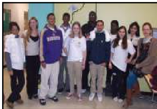
Upper School Allies in Action Group (above)

Students carried away messages of tolerance and acceptance during this conference and learned skills that they can use to take a peaceful stand against bullying and insensitive language in the SACS community. These students have made a commitment to demonstrate leadership by reminding their classmates to treat each other with respect and to tolerate differences.